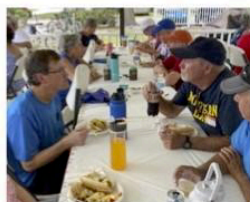
Good Food, Good Company