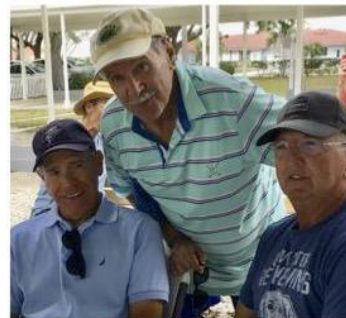
Our Infamous SCC Pickleball Communications Committee