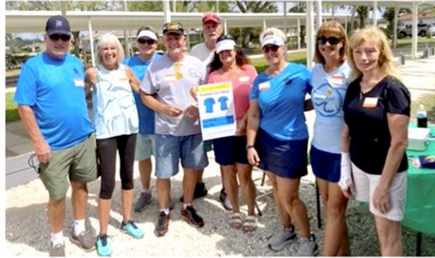
SCC Pickleball T-Shirts For Sale!